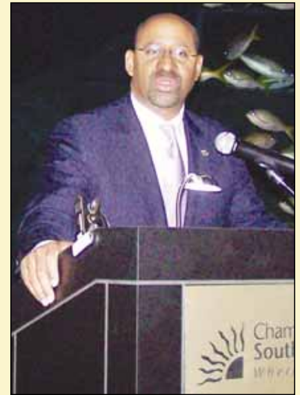
Philadelphia Mayor Nutter addresses Chamber members.

On December 2, Chamber members gathered at the Adventure Aquarium in Camden to honor Philadelphia Mayor Michael Nutter for his commitment to the business community and spirit of regional cooperation. The event was sponsored by Stradley, Ronon, Stevens & Young, LLP and Citizens Bank. ✨