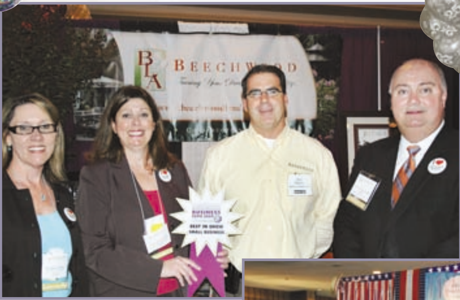
The Best of Show - Small Business exhibit was awarded to Beechwood Landscape Architecture & Construction, Inc.