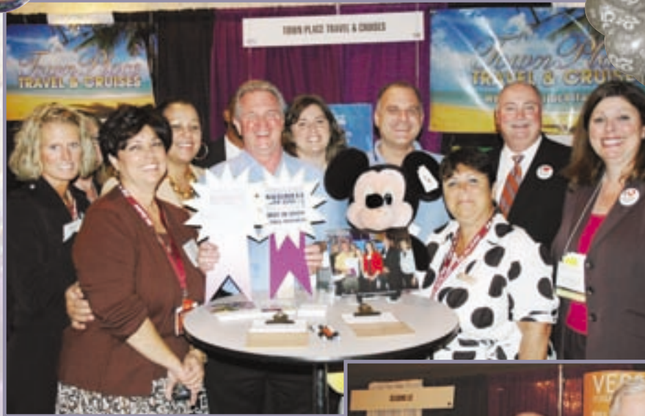
The Most Creative exhibit was awarded to Town Place Travel & Cruises .