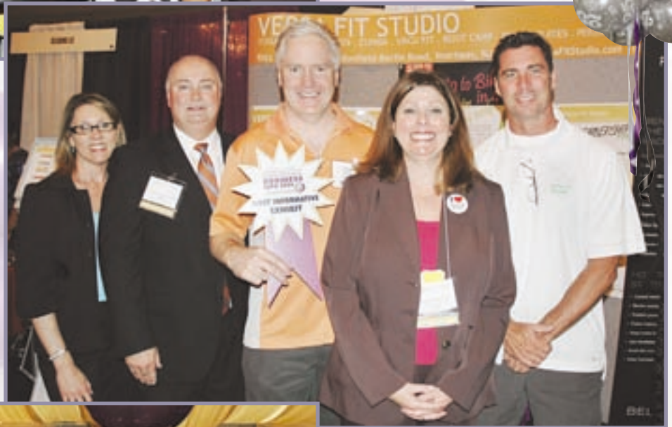
Versa Fit Studio won the Most Informative exhibit, with its Power Plate equipment.