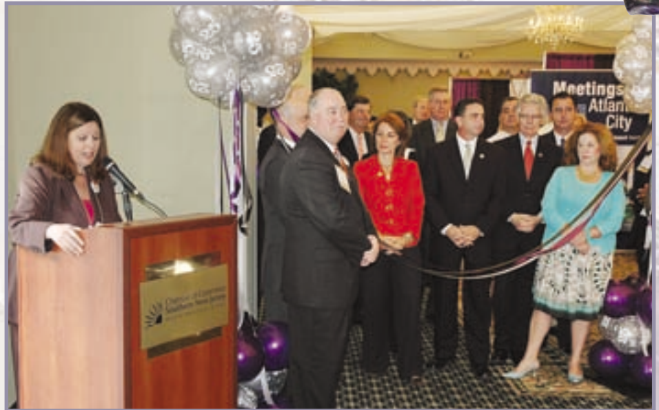
The Expo ribbon cutting ceremony was attended by more than a dozen local, county, State and federal officials.

The participation of our exhibitors and the generous support of our sponsors were key the success of Business Expo 2009. Special thanks to our Gold Sponsors – Virtua, TD Bank and The Philadelphia Inquirer/Philly.com, and our Bronze sponsors: UPS, Harrah's, Atlantic City International Airport, The Richard Stockton College of New Jersey, New Jersey Economic Development Authority, Conner Strong, Camden County Improvement Authority, BF Molz, Verizon, Verizon Wireless, Kiva Printing & Graphics, Balloon Celebrations, AEX Convention Services and the Crowne Plaza. And, thanks to our transportation sponsors, Valero and Atlantic City Electric. ✨