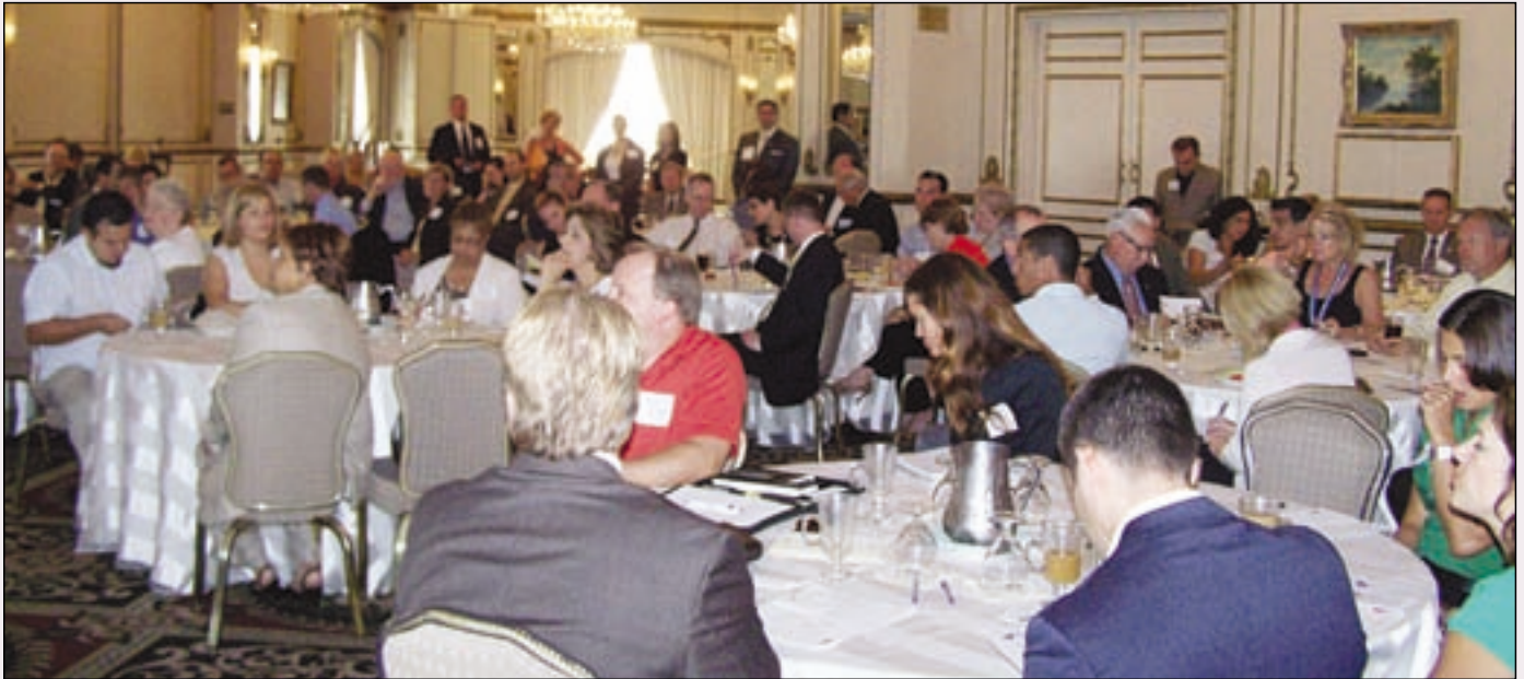
More than 100 members attended the August 26 Member Orientation meeting, sponsored by Bank of America/Merrill Lynch. Members received information on how to make the most of their Chamber membership, and met the Chamber's partners. ✨