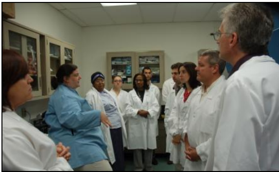
The visit to the Coriell Institute for Medical Research included tours to several laboratories.