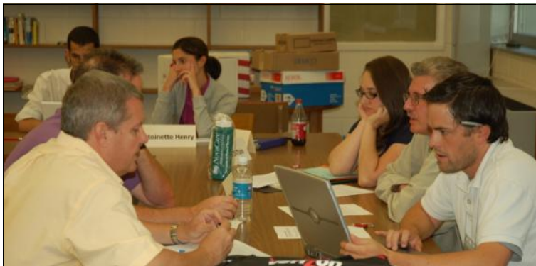
The educators worked in groups to develop curriculum maps in order to infuse the lessons of the Institute into their classrooms.