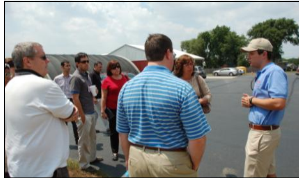
The significance of agribusiness to our region's economy was explained during a visit to Hunter's Farm in Cinnaminson.