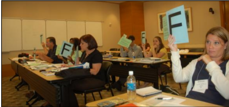
Teachers took part in several learning activities geared to students during their visit to the Federal Reserve Bank of Philadelphia.