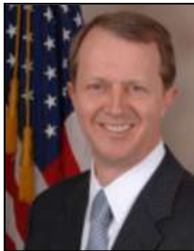
Congressman John Adler