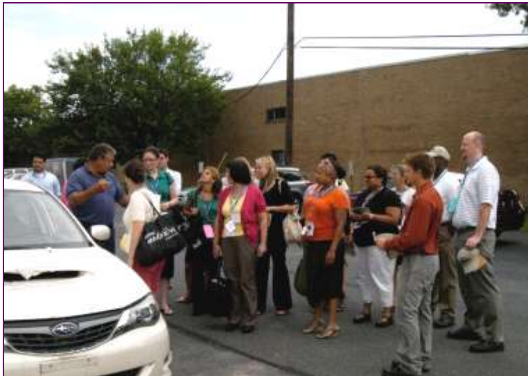
The Summer Institute's tour of Subaru of America, Inc. provided an fascinating look into the automotive industry where the mantra "People, Product & Brand" is promoted. ▲