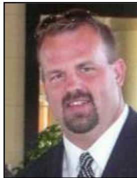
Candidate Jon Runyan