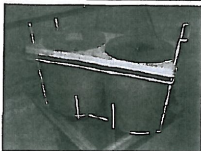
CDC (3 Gallon Ice Cream Containers)