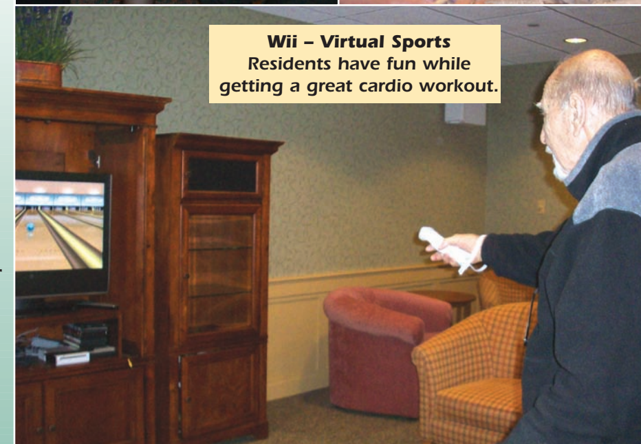
Wii - Virtual Sports Residents have fun while getting a great cardio workout.