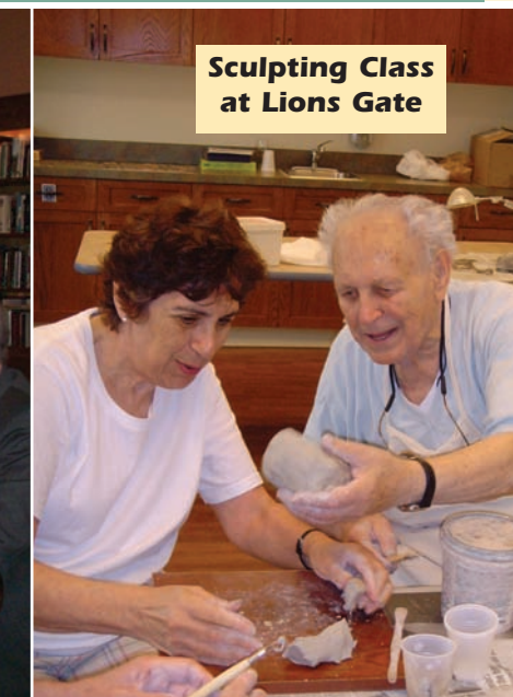
Sculpting Class at Lions Gate